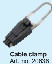
Cable clamp Art. no. 20636