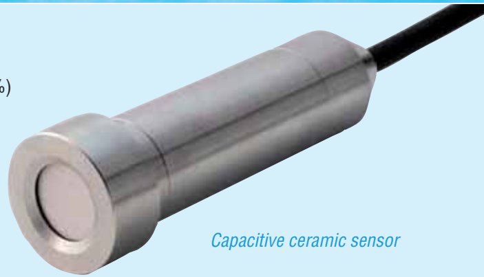
Capacitive ceramic sensor

Specifications can change without notice