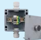
Junction Box FMD(IP67) Art. no. 20069