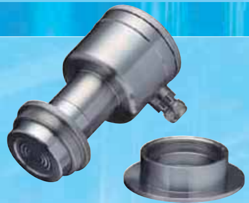
Code W: sanitary weld-on nipple

All ranges mentioned in this brochure on page 2 and 3 are available.