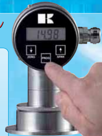
Display with 3 push buttons (Standard)